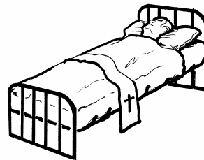
8. DYING WITH NO UNCONFESED MORTAL SIN