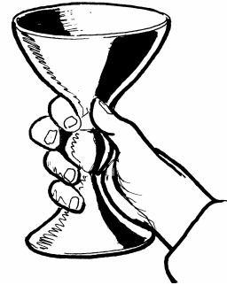
3. GOING TO MASS AND RECEIVING THE SACRAMENTS