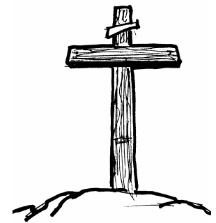
10. TRUSTING JESUS AS SAVIOR