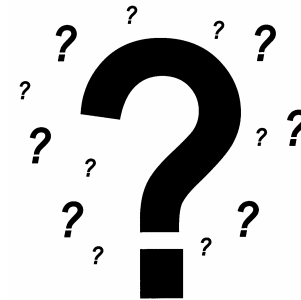
9. ANYTHING ELSE