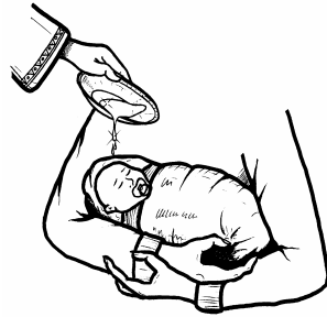
2. BEING BAPTIZED