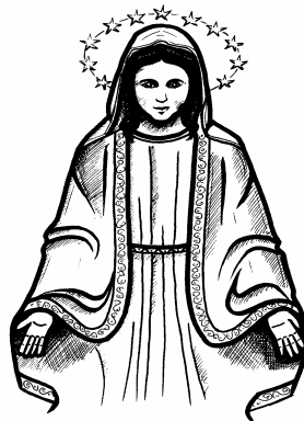
7. PRAYING AND DEVOTION TO MARY