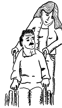
4. LOVING YOUR NEIGHBOR